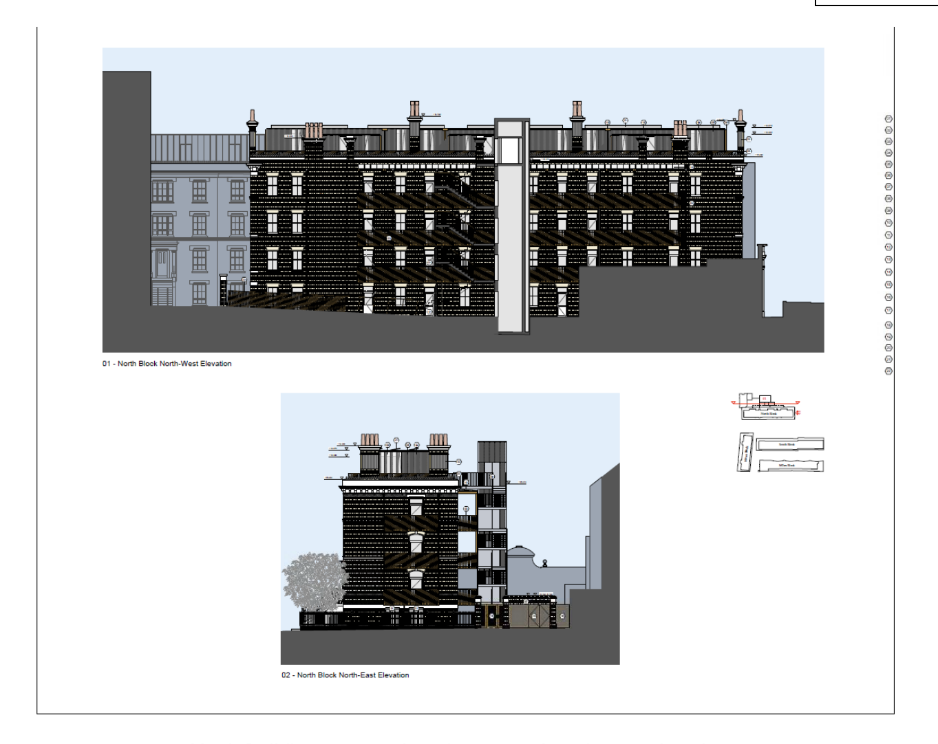
North Building proposed north-west and north-east elevations