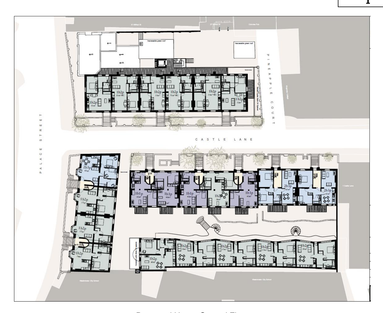
Proposed Upper Ground Floor