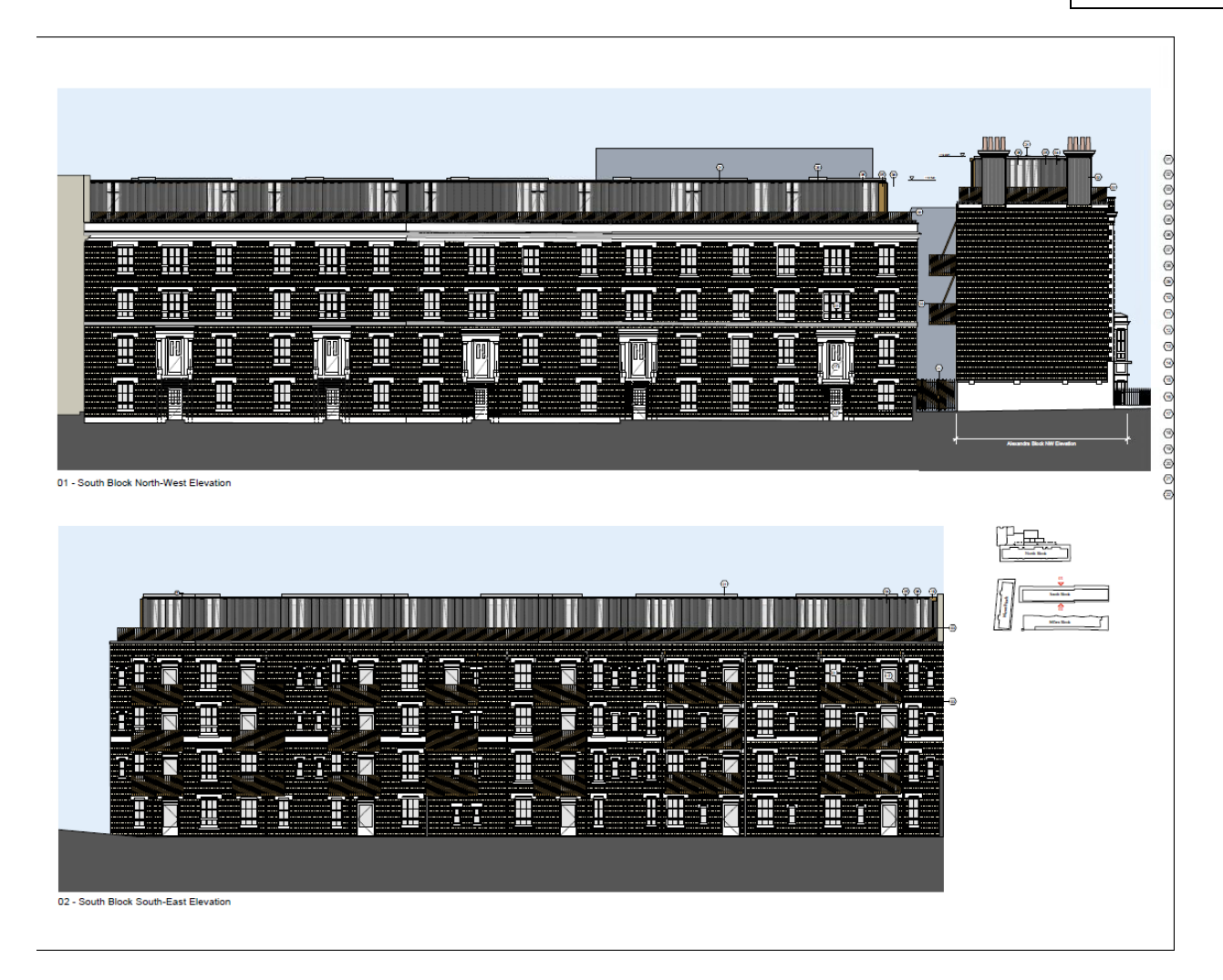
South Building proposed front and rear elevations