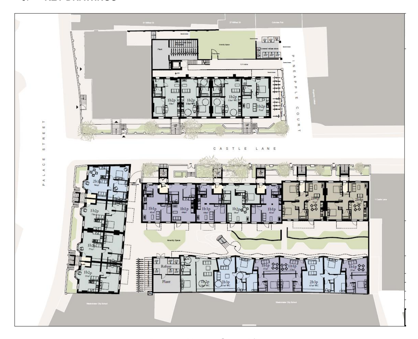
Proposed Lower Ground floor